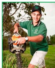
Horticulture – Parks and Gardens

To apply and for more information please go to: http://austrg.com.au/job-vacancies/ or go to our home page http://austrg.com.au and click on